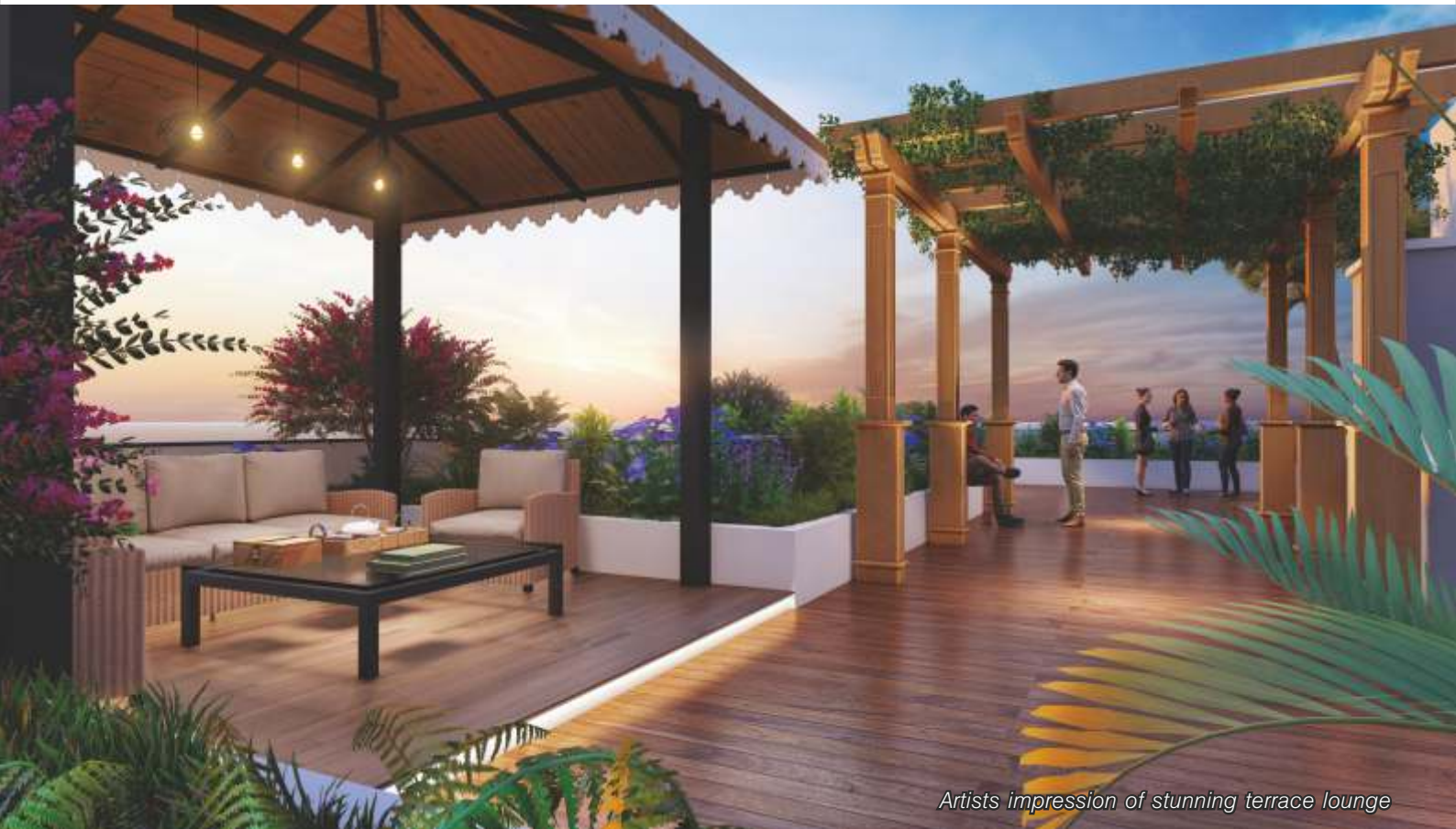
Artists impression of stunning terrace lounge