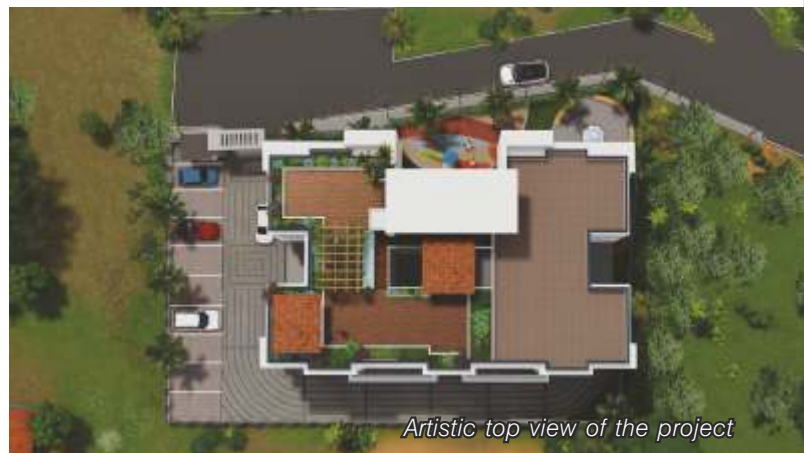
Artistic top view of the project